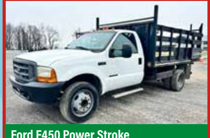
Ford F450 Power Stroke

(OFF US-15/US-340) ADJACENT TO Virginia Maryland Tractor, Authorized John Dealer