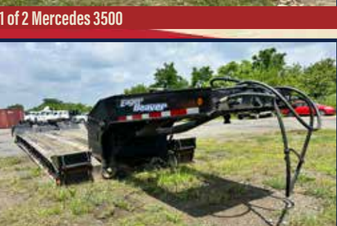
2004 Eager Beaver 35 Ton Detachable